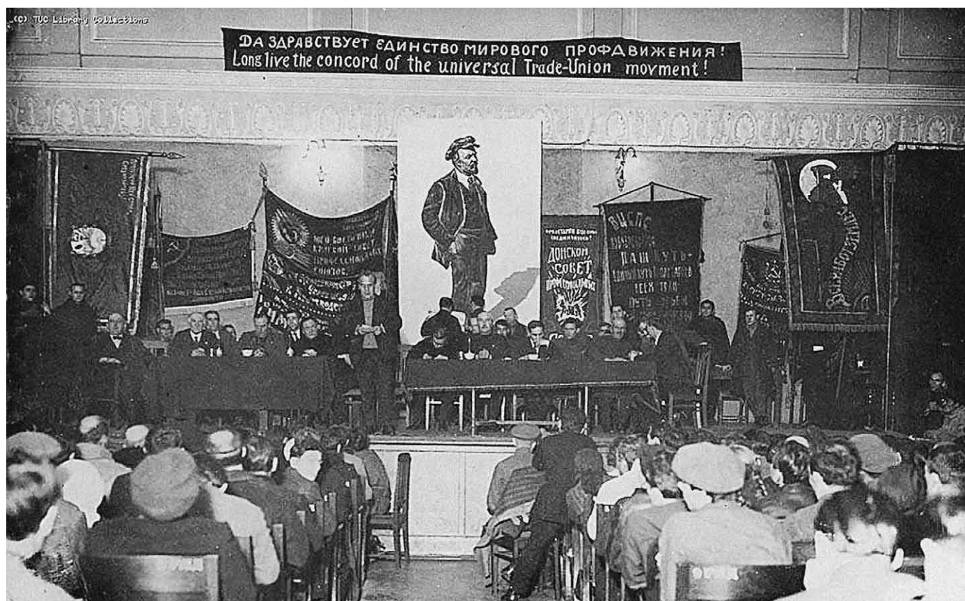
TUC LIBRARY COLLECTIONS

In addition, in 2010 our colleagues at the TUC Library Collections received a grant from the Lipman Miliband Trust to translate Russian language documents, posters and photo albums brought back by labour movement delegations to the Soviet Union in 1920-25.