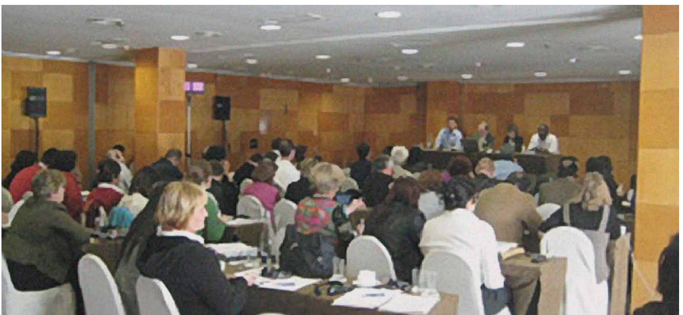
Presentation of the WLRI report on union recognition in the private healthcare sector to RCN representatives