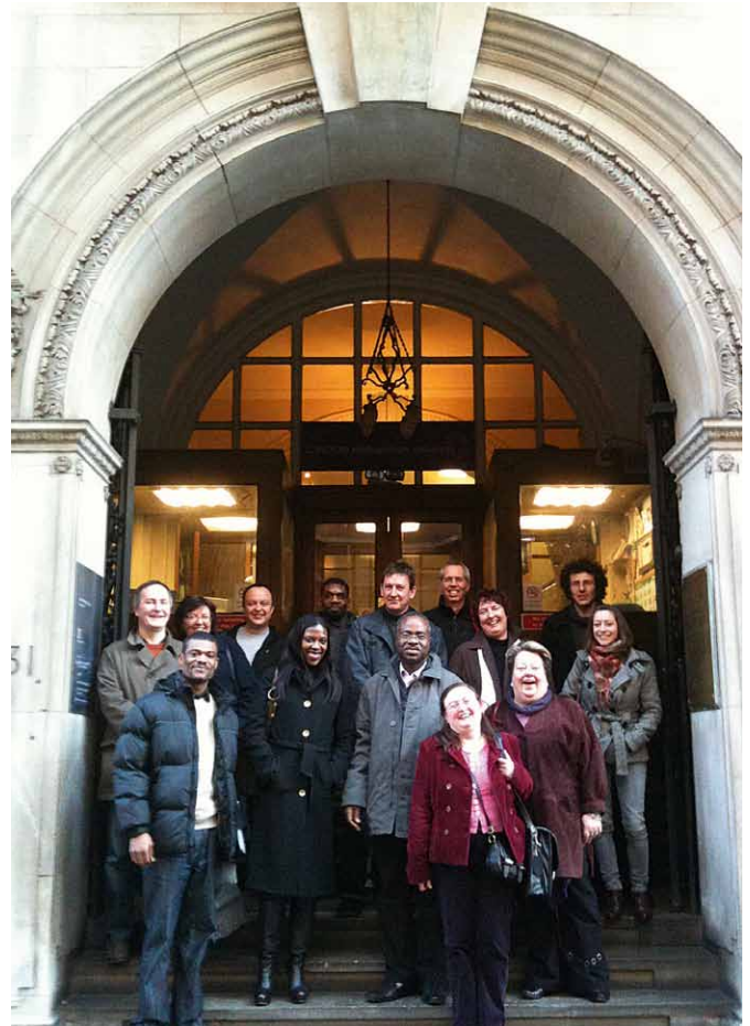
WLRI students on the Professional Doctorate course

The year saw the successful continuation of the Certificate in Professional Development (CPD) in Union Learning. The CPD, run jointly by the Institute